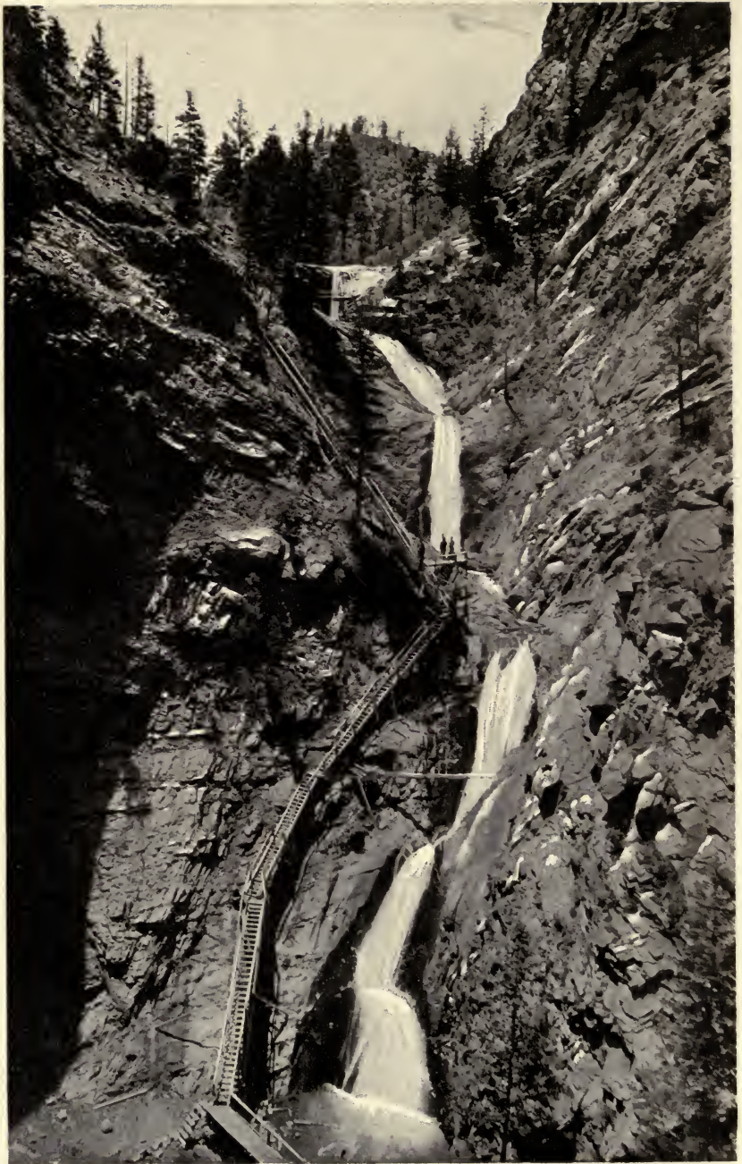
CHEYENNE CANON--SOUTH THE SEVEN FALLS